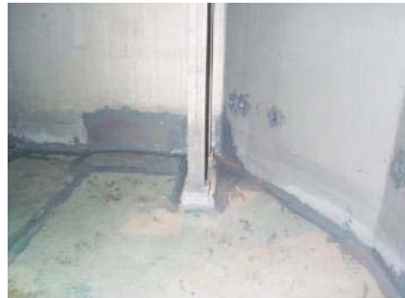
Repairs Around Pool Base

RESULT: The BIO-DUR 561 coating was applied by university personnel to selected portions of the aluminum liner including weld seams along the pool floor, around beam flanges and on several areas of pitting.