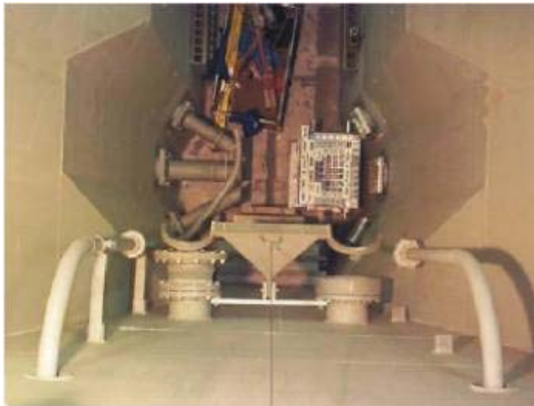
Overhead View of Reactor

THE SOLUTION: The university selected TFT BIO-DUR 561 for this application. BIO-DUR 561 is available in a "Nuclear" version approved by EPRI as an underwater applicable coating suitable for Service Level 1 applications within the primary containment of nuclear plant. Since this application was to be made in dry conditions it would be extremely straightforward although its proven resistance to radiation was reassuring.