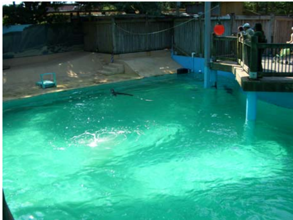
Sea Lion Enclosure before project

THE CHALLENGE: The sea lion enclosure at the Houston Zoo was ready for redecorating to upgrade the attraction. Although the applications were to be made “in the dry” it was understood that the concrete surfaces were liable to be moist after years of sea-water service. Houston summer weather which can generate thunderstorms in an instant was also a factor to be considered. A smooth, tough coating to provide years of service which was compatible with the application requirements was required.