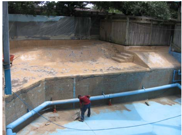
Preparation work in progress

THE SOLUTION: The coating contractor, Modern Maintenance of Spring, TX, met with zoo officials and TFT in a pre-award meeting to discuss requirements for timing, color etc. Because of the tight scheduling requirements and the need for a smooth coating it was necessary to apply the coating by spray. In order to satisfy environmental requirements the TFT solvent-free coating BIO-DUR 560 was chosen. This material was custom tinted to the specified color and especially engineered to have excellent UV resistance. Severe thunderstorms threatened serious delays during the last and most critical days of the project. Because of the extreme water tolerance of BIO-DUR 560 however the crew working in the rain was able to apply the entire waterline area using rollers.