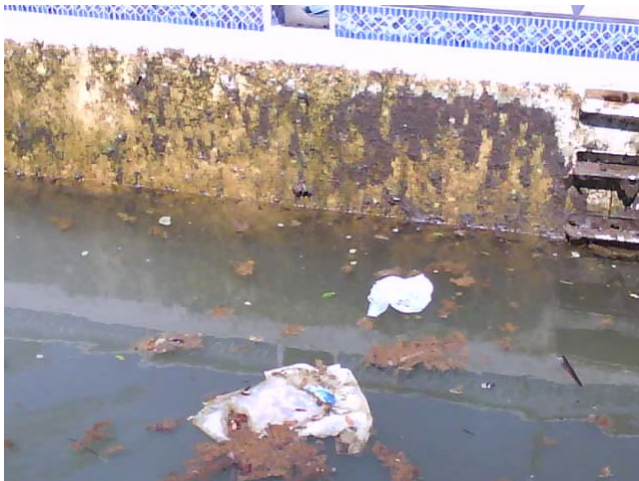
Appearance during initial draining

THE CHALLENGE: When Hurricane Ike tore through coastal Texas in the fall of 2008, it left a swath of damage which took months to repair. One such repair was the family swimming pool of a Galveston Bay waterfront home that was filled with debris and brackish water for over six months while the family house was being repaired after storm damage and flooding. After long exposure to bay water, the plaster surface was covered in barnacles and weakened by exposure to salt water.