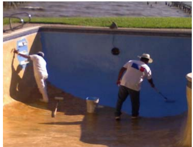
First Fastonite 700 application over sealer

The contractor used BIO-FIX 911 , a Kevlar® reinforced “5 minute” epoxy repair compound to smooth and fill the blister pockets. Consequently, the final coating was possible within 5 minutes of application so as to avoid extending the overcoating interval unnecessarily.