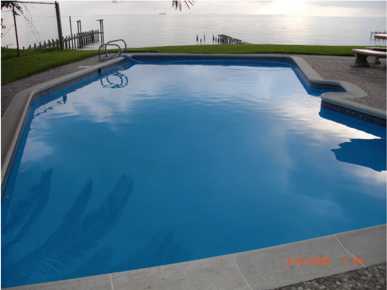
Finished pool – Galveston Bay in background

RESULT: The pool was closely examined before filling to ensure no more blistering “surprises” were found. Once the quality of the coating was confirmed, the pool was refilled with water after a 24 hour curing period. The pool is now restored to a beautiful appearance and due to the FASTONITE lining, it will consume only a fraction of the pool chemicals previously used.