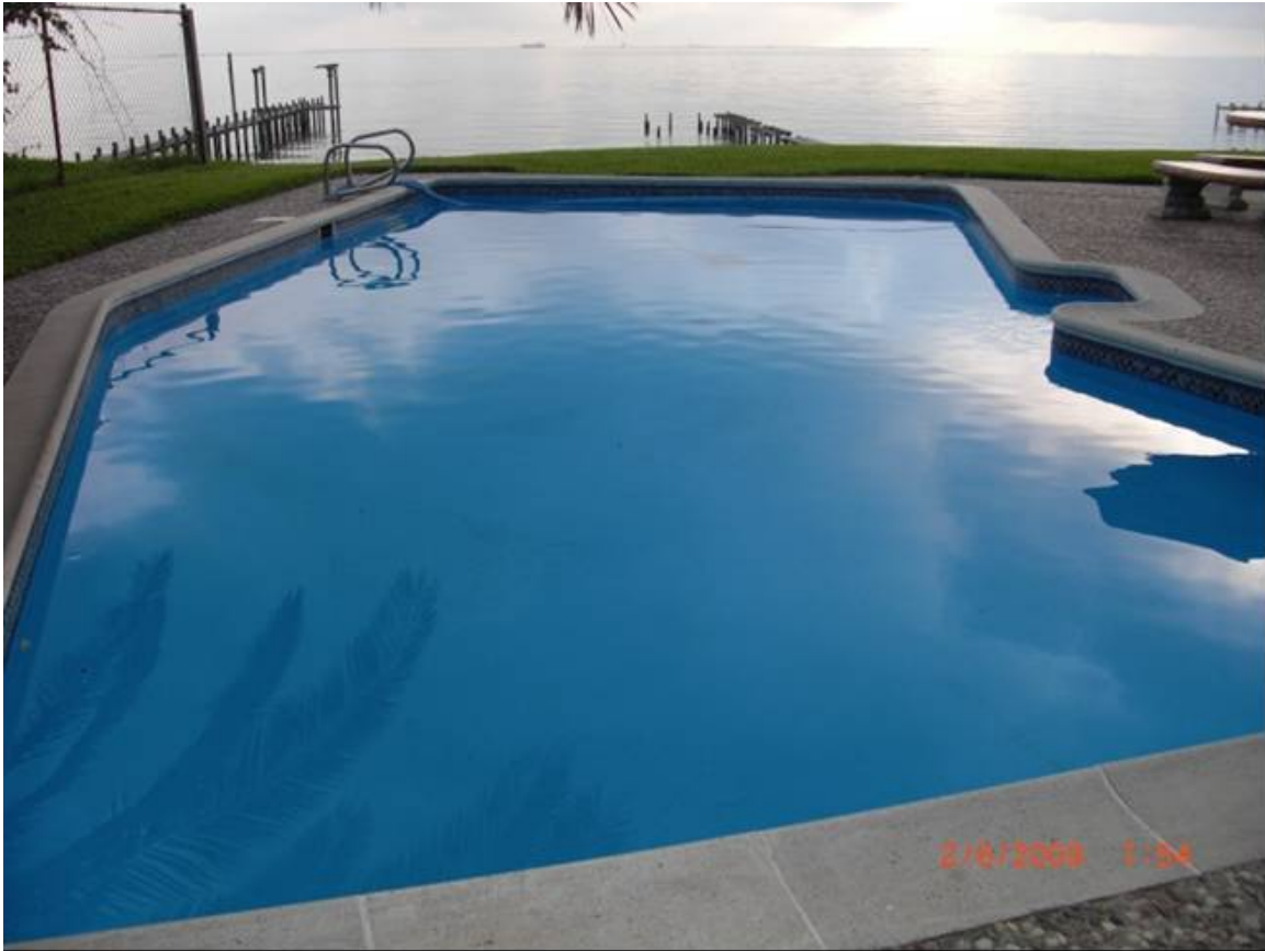
Finished pool – Galveston Bay in background

The final coat of Fastonite was applied within the recommended overcoating interval and, in some cases, within minutes of the BIO-FIX 911 repair.