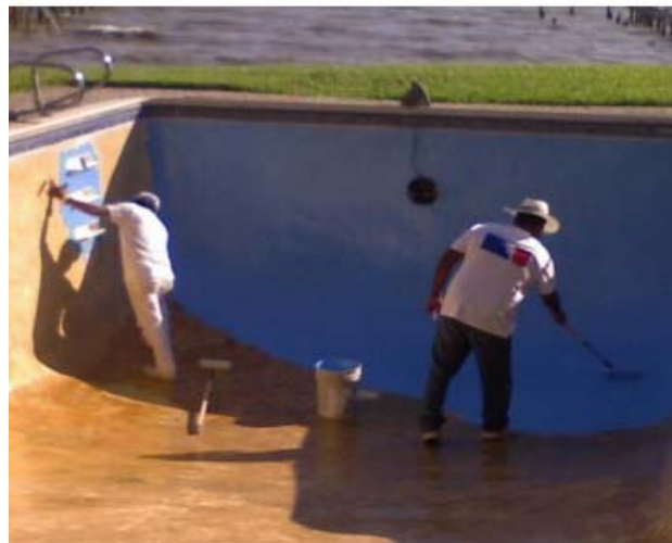
First Fastonite 700 application over sealer

The contractor used BIO-FIX 911 , a Kevlar® reinforced “5 minute” epoxy repair compound to smooth and fill the blister pockets. Consequently, the final coating was possible within 5 minutes of application so as to avoid extending the overcoating interval unnecessarily.