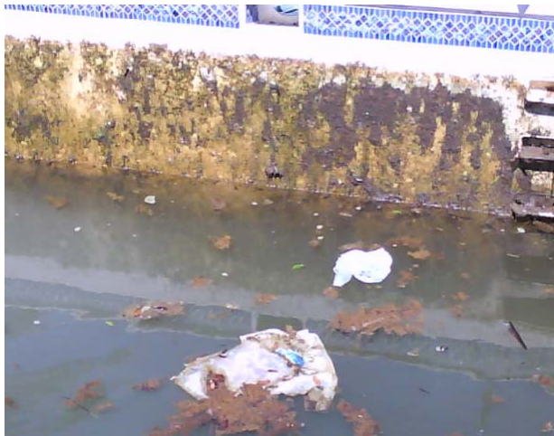
Appearance during initial draining

THE CHALLENGE: When Hurricane Ike tore through coastal Texas in the fall of 2008, it left a swath of damage which took months to repair. One such repair was the family swimming pool of a Galveston Bay waterfront home that was filled with debris and brackish water for over six months while the family house was being repaired after storm damage and flooding. After long exposure to bay water, the plaster surface was covered in barnacles and weakened by exposure to salt water.