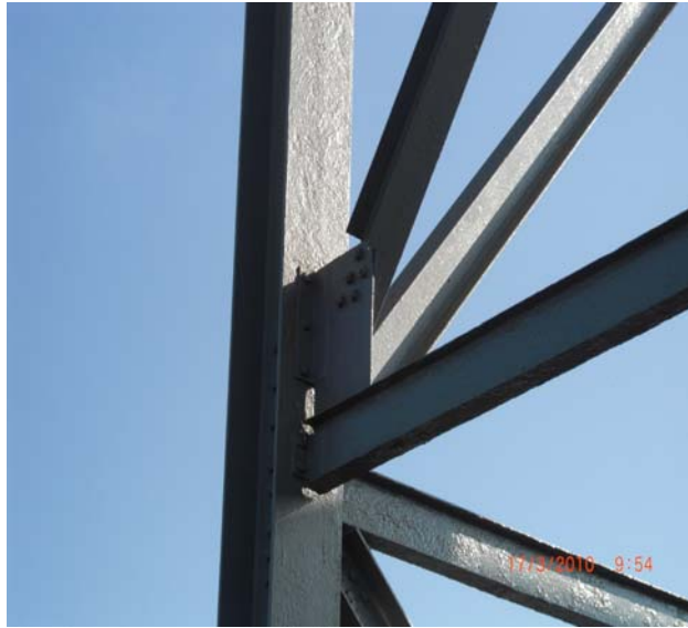
BIO-GARD 257 applied over complex surface

RESULT: The coating contractor is pleased with the tolerance of BIO-GARD 257 to wet or moist conditions during application. The steel structure is now protected with a tough and durable epoxy coating to resist the effects of a brutal marine and industrial Gulf Coast exposure.