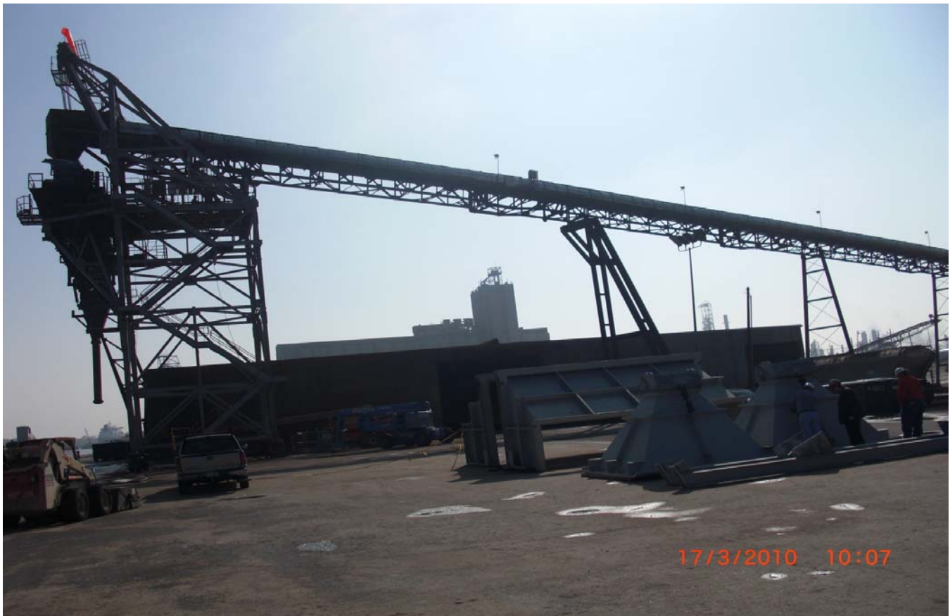
Ship Unloader – General View