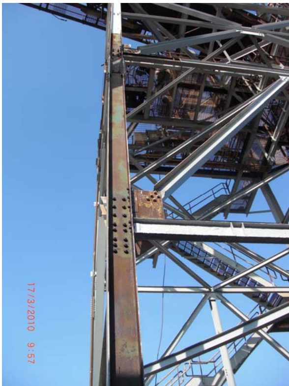
Appearance during application

The choice of the recoating system was complicated by a prohibition on abrasive blasting and spraying imposed by the Port of Beaumont and Kinder Morgan's insistence on an overall eco-friendly painting process.