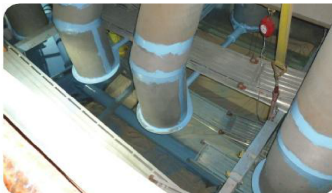
After abrasive blasting the steel, the crew applied a stripe coat and then a minimum of 30 mils (762 microns). They applied the epoxy with plural component airless spray and 400-foot-long (122 m) hose.

But Longmore kept selling to them, and he is certainly glad he did because this job is a complete relining — all 32,000 square feet (2,973 m 2 ) of the internal surface of carbon steel of a large torus pressure vessel. "As time went on, they got more and more entrenched in the business," Longmore said. "Eventually they had this client that had a major recoat to do — it was long past touchups. It was on a torus that had inorganic zinc coating that was exhausted. It needed a major repaint. Our product is specialized, it sprays easily, and it cures under water. So they