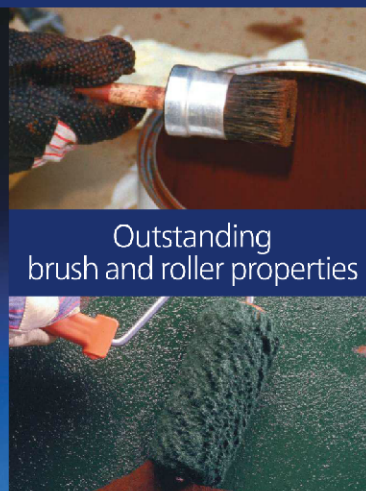
Outstanding brush and roller properties

Simply better corrosion protection. For the smaller maintenance jobs. Easy to get right. Tough to get wrong.