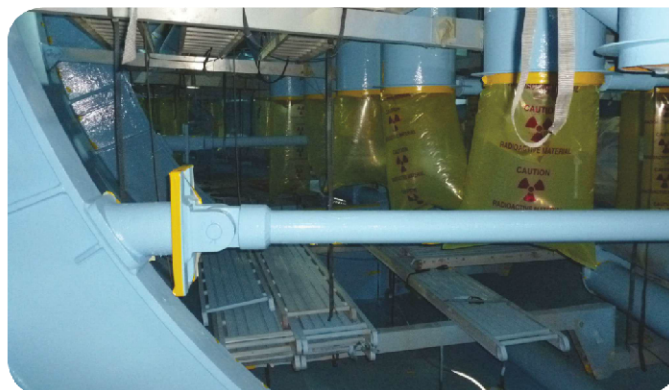
It took this seasoned coatings crew less than one week to complete this important project. As Jeff Longmore of Thin Film Technology, Inc., the coatings manufacturer, said, "It was picture perfect."

There were also operational challenges, including emptying the torus of water before the coatings application. "The torus is where many critical plant systems drain water to and take water from, so when the torus is drained for recoat, the