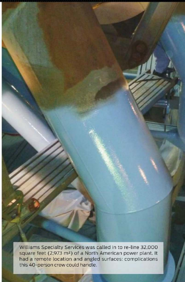
Williams Specialty Services was called in to re-line 32,000 square feet (2,973 m 2 ) of a North American power plant. It had a remote location and angled surfaces: complications this 40-person crew could handle.

Longmore came by the job because of a long-standing relationship with Underwater Construction Corporation, an Essex, Connecticut-based diving company. Underwater Construction Corporation employs divers for a number of jobs, and one of them is to dive into nuclear reactors to weld, inspect, and apply coating.