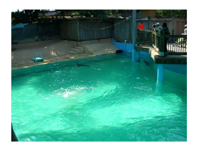
Seal Lion Enclosure before project

THE CHALLENGE: The sea lion enclosure at the Houston Zoo was ready for redecorating to upgrade the attraction. Although the applications were to be made "in the dry" it was understood that the concrete surfaces were liable to be moist after years of sea-water service. Houston summer weather which can generate thunderstorms in an instant was also a factor to be considered. A smooth, tough coating to provide years of service which was compatible with the application requirements was required.