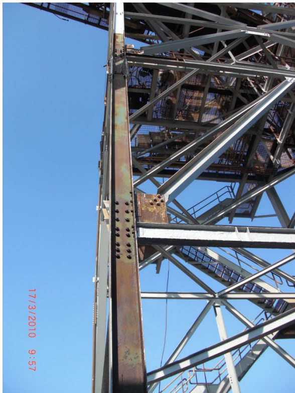
Appearance during application

The choice of the recoating system was complicated by a prohibition on abrasive blasting and spraying imposed by the Port of Beaumont and Kinder Morgan's insistence on an overall eco-friendly painting process.