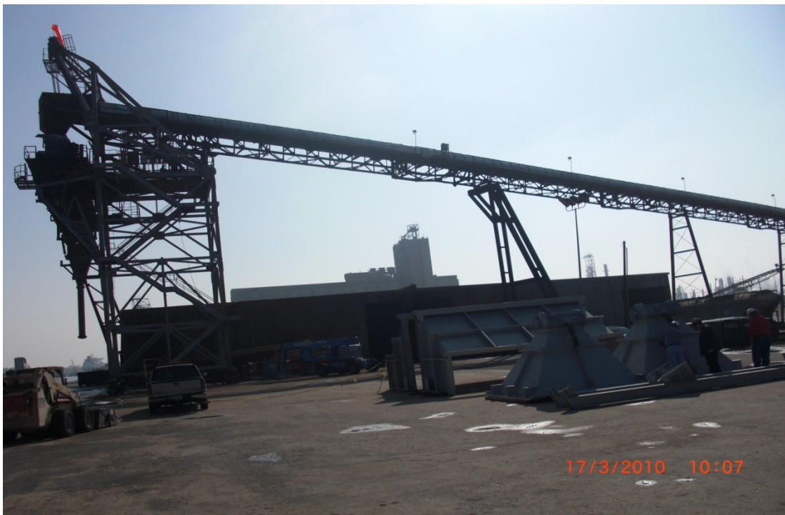
Ship Unloader – General View