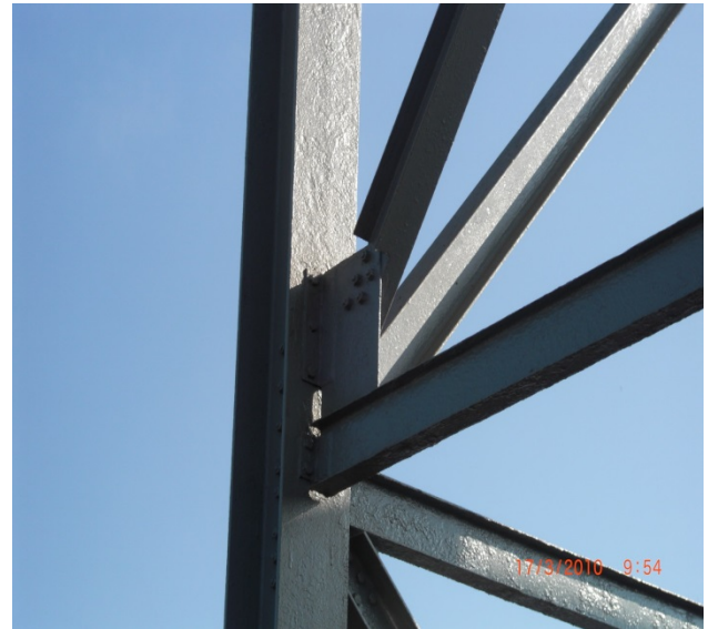
BIO-GARD 257 applied over complex surface